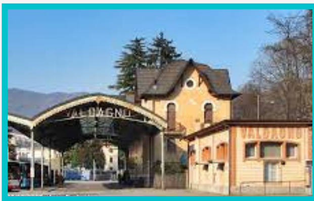
Valdagno Bus Station

Once you are already on board, after 1hour you should be in Valdagno, that means that you are getting closer to Recoaro (15min no much more), so keep your eyes open.