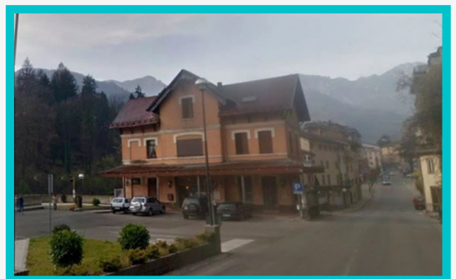
Recoaro Bus Station